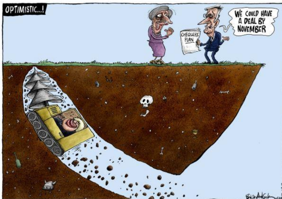
Brian Adcock's take on Boris undermining Theresa's Brexit plan saying it is 'worse than status quo' No s*** Sherlock! Source: Political Cartoon Gallery; 12 Sep 2018