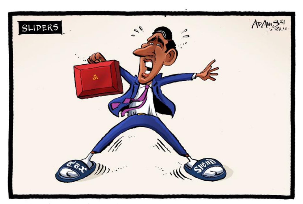
UK budget splits