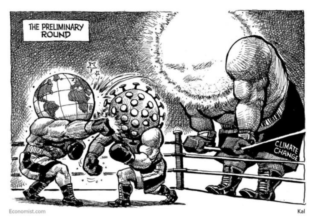
Mankind's next challenge, 23 April 2020